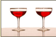
The Letters Of Wilkie Collins Volume 1 V 1 1